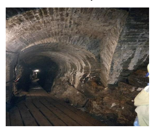
Figure 4: Uranium Mines, Annaberg-Buchholz

I also got a chance to attend the international Christmas party which was organized by the TU international office, where I enjoyed food from different nations and got to learn different cultures through dances and stories.