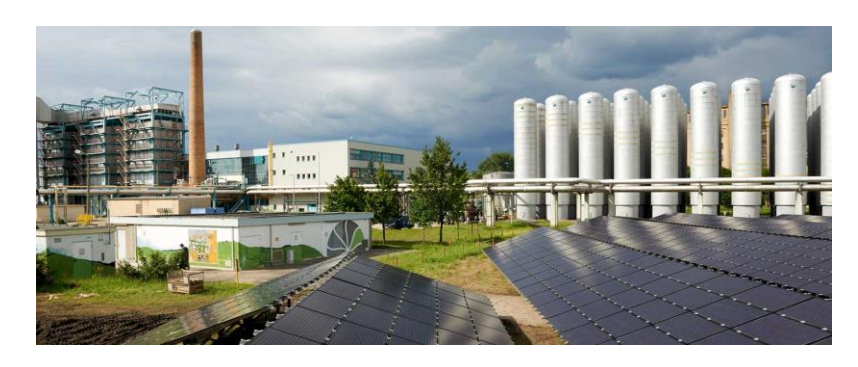
Figure-1: Steam chambers at DREWAG

We also visited KIWIGRID, a company concerned with energy management and smart metering systems (fig 2). Founded by energy transition enthusiasts, KIWI|GRID envisions on a sustainable energy world by developing and operating cutting-edge internet of things (IoT) platforms. Their belief is to have a world which runs on 100% sustainable energy.